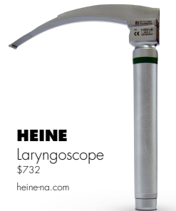
HEINE Laryngoscope $732 heinenusa.com