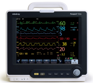
MINDRAY Passport 12 Monitor $4,800 (starting price) mindraynorthamerica.com