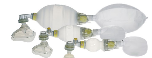
LEARDAL Resuscitator $192 leardal.com