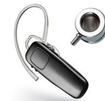
SEDATION RESOURCE Bluetooth Stethoscope $649 sedationresource.com