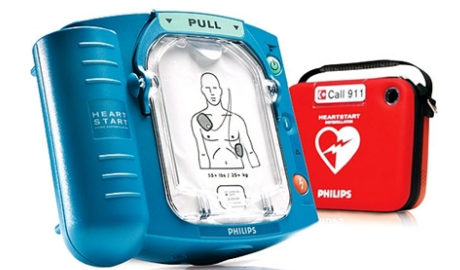
PHILIPS AED $1,199 heartsmart.com