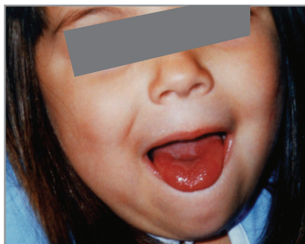
Figure 1. Fiery red glossitis

Repeated laboratory testing, however, did not confirm the presence of neutropenia, and the patient did not exhibit destructive oral ulcerations or repeated severe infections. Hyper-IgD was considered but laboratory testing never indicated sustained high levels of IgD. The skin lesions did not resemble the erythematous papules, which may be seen in hyper-IgD