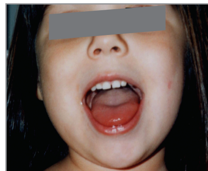
Figure 3. Appearance of tongue between episodes

In 2002, the patient was hospitalized for respiratory distress with tachypnea and a diagnosis of acute exacerbation of severe persistent asthma. She required intubation and mechanical ventilation and remained hospitalized for 10 days. The patient's asthma was subsequently controlled with albuterol and a fluticasone 220 mcg/dose inhaler (2 puffs twice daily). The family history was significant for asthma (mother and maternal uncle). A maternal first cousin's daughter had a low level of IgA, IgE, and IgG. In addition, a paternal uncle reported frequent colds and infections as a youth. A maternal uncle has a diagnosis of neutropenia (not cyclic) as a child, and the maternal grandfather has reactive airways disease. All laboratory results, including repeated neutrophil counts, erythrocyte sedimentation rate, IgA, IgG, IgM, and IgD, were normal. The patient had slightly increased eosinophil counts (13%). Total IgE was increased (514 mg/dl), as was the IgE specific for dog, cat dander, and dust mites.