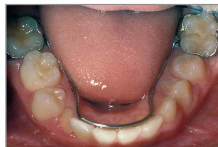
Figure 6. Mandibular lingual arch on the banded permanent first molars.