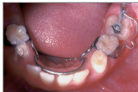
Figure 3. Mandibular occlusal view shows a modified bilateral Halterman appliance. Used with permission. 3