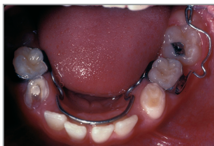
Figure 5. Mandibular occlusal view shows correction of impaction. The lingual arch was retained to stabilize the resorbed primary mandibular left or second molar.