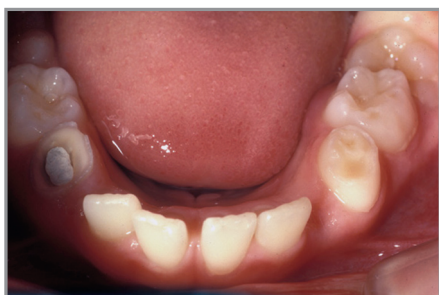
Figure 1. Mandibular occlusal view shows a severe impaction of the permanent mandibular left first molar.

One problem with the appliance was the need to open and close the recurved loop on the distal extension when the chain