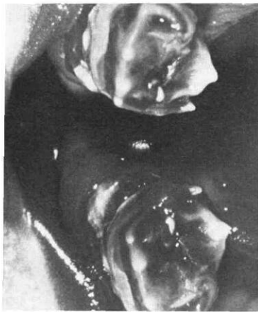
Figure 2. Close-up of natal molar. Note mamelons on the occlusal surface.