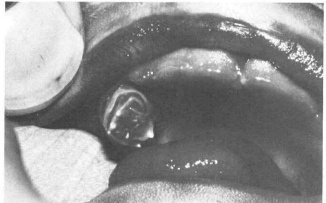
Figure 1. Maxillary right natal molar.

Intraoral examination revealed a .5 x .4 x .3 cm firm, nodular, exophytic lesion with a variegated surface attached by a broad base to the maxillary right posterior alveolar ridge. Protruding from the otherwise convex and erythematous surface were what appeared to be multiple abortive mamelons with the color of normal tooth structure (Figures 1 & 2). The location of the lesion on the