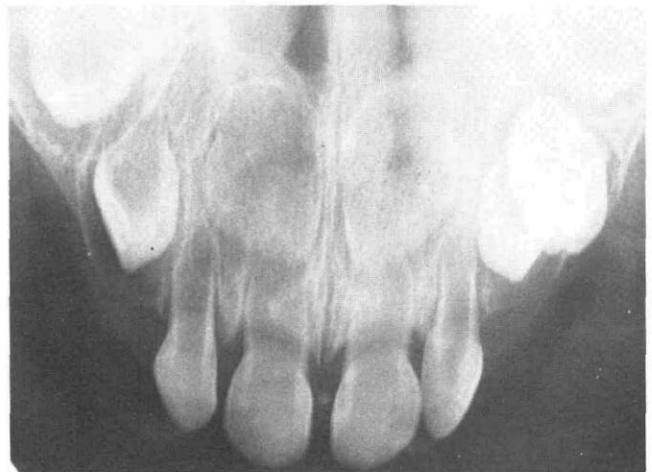
Figure 4. Occlusal radiograph of the patient at age nine months. The maxillary left primary first molar is visible but the right is missing.

Surgical procedures on newborns should not present significant difficulties. These may be performed in the crib or in a separate surgical area such as a circumcision table. Several authors have reported that surgery should be postponed if possible until the tenth postpartum day to