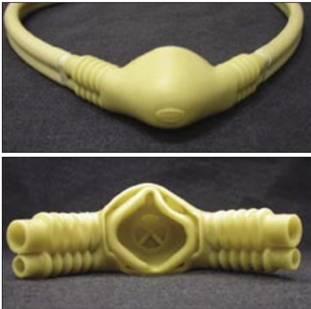
Figure 3a. Porter/Brown scavenging nasal hood—front outside view.

of the procedures, and the values for measurements 3 and 4 were when the particular nasal hood was used for the second half of the procedure after the hood was changed. For all measurements, there was relatively large variability leading to large standard deviations around the mean scores. Nevertheless, with the Porter/Brown nasal hood, the nitrous oxide levels were statistically significantly lower than with the Accutron nasal hood ( P < .001 ) for patient and room measurements. For each of the patient measurements with the subjects using the Accutron mask, the mean values were 410 \pm 148 , 368 \pm 109 , 382 \pm 81 and 368 \pm 107 ppm compared with 36 \pm 36 ppm, 23 \pm 37 ppm, 38 \pm 43 ppm, and 169 \pm 112 ppm when the Porter/Brown mask was used. For the room measurements, the mean values were 77 \pm 43 ppm, 97 \pm 42 ppm, 104 \pm 33 ppm, and 121 \pm 50 ppm with the Accutron mask, compared with 3.5 \pm 3.7 ppm, 2.1 \pm 1.9 ppm, 14 \pm 12 ppm, and 29 \pm 18 ppm with the Porter Brown mask.