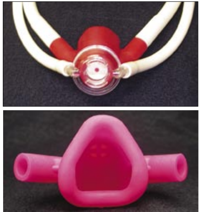
Figure 4a. Accutron scavenging nasal hood—front outside view. Figure 4b. Accutron scavenging nasal hood—back inner side.

In contrast, patients seemed to prefer the Accutron mask, since it comes with different flavors and colors. It would be advantageous if the Porter/Brown system was manufactured with different flavors and more favorable colors. Since the levels of nitrous oxide were significantly higher with one system that is commonly used in pediatric dental operatories, those levels should be measured in private dental offices in future studies. In this study, only 2 different scavenging systems were compared. Future studies should examine the effectiveness of other scavenging nasal hoods used in pediatric dentistry.