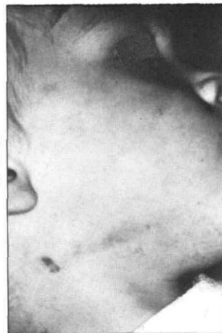
Figure 2. Ecchymosis of the skin surface of the angle and inferior border of the right side of the mandible.

physical injury was photographed using 35 mm color slide film (Figures 1-3).