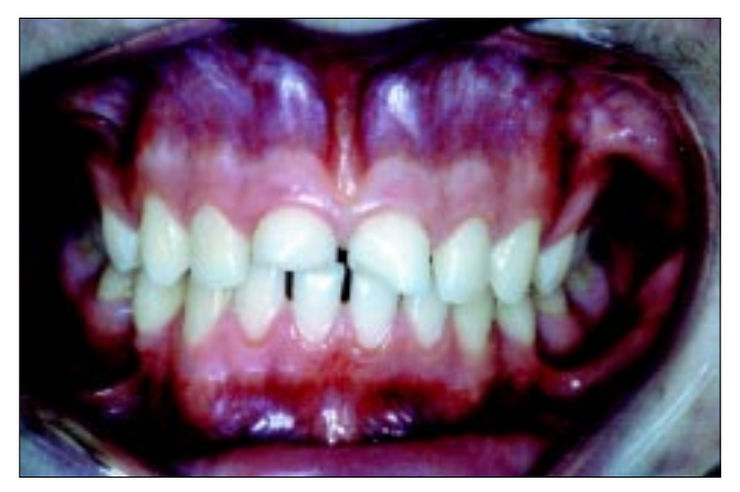
Fig 2. An example of erosion of the buccal surfaces of the upper permanent incisors (same subject as Fig 1).

3 and 4 present examples of abrasion and attrition, respectively, for comparison.