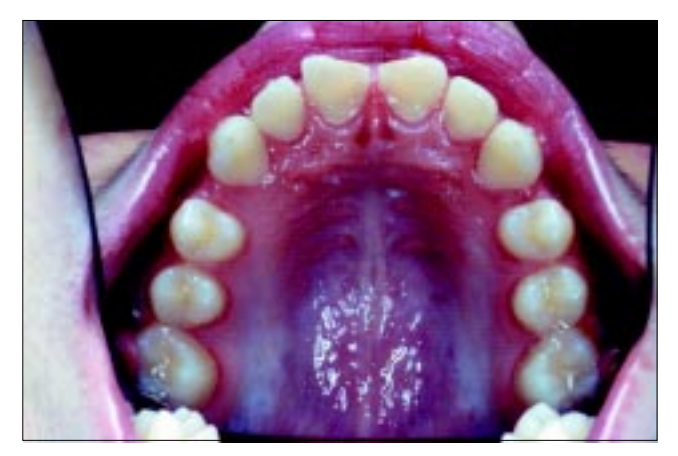
Fig 1. An example of erosion of the palatal surfaces of the upper permanent incisors.

ooth surface loss or tooth wear can arise as a result of erosion, abrasion, and attrition.<sup>1</sup> Erosion is the loss of dental hard tissue by a chemical process, which does not involve bacteria.<sup>2</sup> Abrasion is the pathological wearing away of tooth substance by a foreign body independent of occlusion. Attrition is the loss of tooth substance as a result of tooth to tooth contact. Accepting that these process are not seen in isolation, history and clinical appearance can lead to the identification of the predominant etiological cause of tooth surface loss.<sup>1,3,4</sup> Teeth affected by erosion become rounded, lose their surface characterisation, and any restorations present become proud. Once dentine is exposed, "cupping" of "lesions" on occlusal surfaces may be seen. Figures 1 and 2 present an example of erosion of the upper permanent incisors in a 12year-old British boy. In the case of attrition, wear will occur evenly and only on surfaces in tooth to tooth contact. Figures