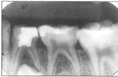
Fig 1. Radiographic failure of first primary molar treated with formocresol due to internal resorption. Preoperative radiograph (1a, left). Radiograph at 3-month postoperative period with internal resorption within the mesial root canal (1b).