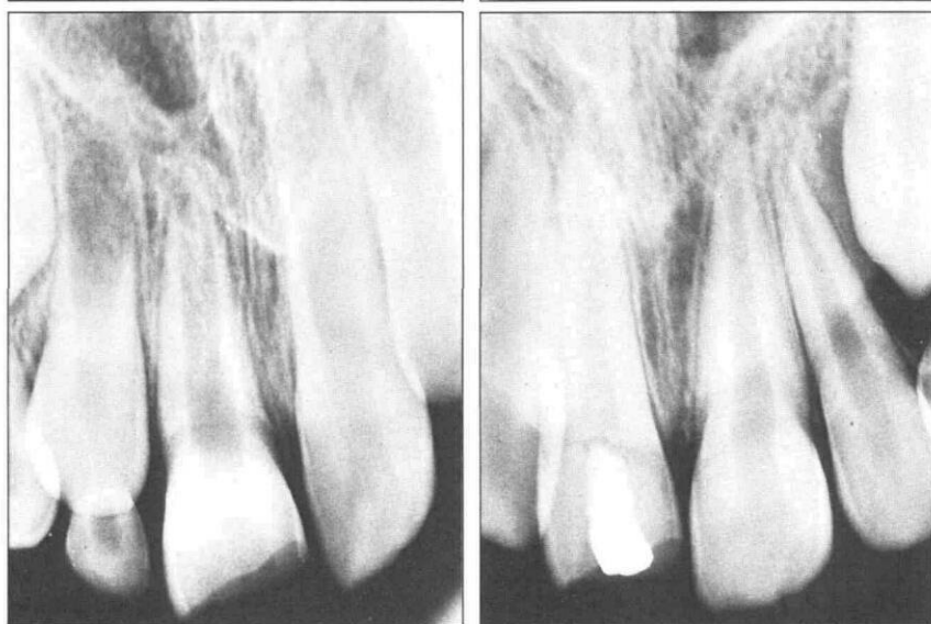
Figure 3. (At right) Upper central incisor with complicated crown fracture treated by pulpotomy: (a) immediately before treatment — the root is incompletely formed and the apex is wide open, (b) 25 months after treatment — the root is fully formed and the apex is closed.

This tooth was listed as a failure although there were no other clinical signs or symptoms.