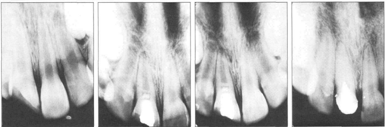
Figure 4. Complicated crown fracture in upper central incisor treated by pulpotomy followed by complete obliteration of the root canal (left to right): (a) preoperative radiograph taken before treatment, revealing an immature tooth, (b) a dentin bridge was already evident 4 months postoperatively, (c) 10 months after treatment — notice the presence of a thick dentin bridge; the root apex is almost closed, (d) complete obliteration of root canal is evident 4½ years after pulpotomy.

val between the accident and treatment does not seem to be critical for healing (Table 2). This confirms the conclusions of Cvek, who utilized a partial pulpotomy technique. 2 The present results are based on a rather small number of cases however; it is possible that with a larger sample the time interval may become statistically significant.