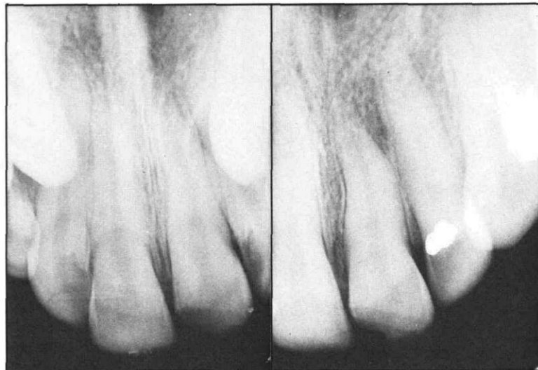
Figure 1. Upper central incisor with complicated crown fracture treated by direct pulp capping: (a) immediately before pulp capping, (b) 52 months after pulp capping.

one case, pulp necrosis occurred as early as one week after treatment; in 4 cases, necrosis was observed 2 or 3 months after pulp capping, and in the last 2 cases, necrosis appeared after 6 and 7 months. Figure 1 shows a central incisor prior to direct pulp cap-