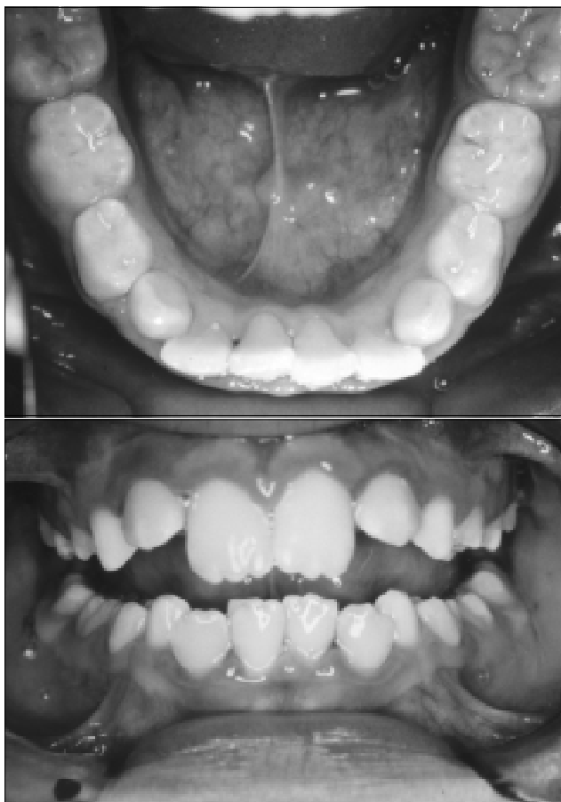
Fig1. The slipped contact arrangement of the mandibular lateral incisors

This incisor arrangement has been considered to have an undesirable effect on future development. 7 This is because no relief of incisor crowding is expected after the mandibular lateral incisors erupt. 3 Furthermore, no intercanine width increase is expected at the exchange of the primary for permanent canines. 3-6,8 We observed the course of slipped contacts over time, evaluating intercanine width, and found slipped contacts to have a desirable effect on future development. Theoretical explanations for these findings are presented, as well as clinical implications.