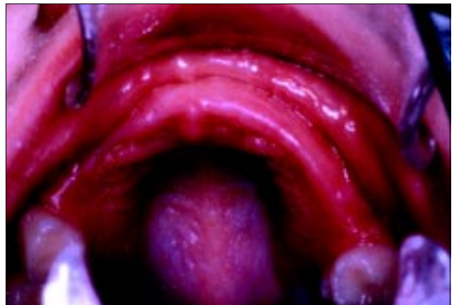
Fig 2. Occlusal view of the 34-month-old patient approximately one year following the avulsion trauma

Based on the radiographs, avulsion of all teeth appeared to be complete and no residual roots were detected save for a small root apex of the right central incisor. Also noted, was the absence of both lateral incisor tooth buds. Parental consent was obtained and the child was placed in a Papoose Board™ (Olympic Medical, Seattle, WA) and a mouth prop was inserted to facilitate suture removal. Minimal bleeding was controlled with the application of gauze pad pressure. Parents were informed that multiple avulsions, including molars, are a rare occurrence, that replantation was not indicated at the time of injury nor at the present time and that a space maintainer would be necessary in the future to address future esthetic, functional and