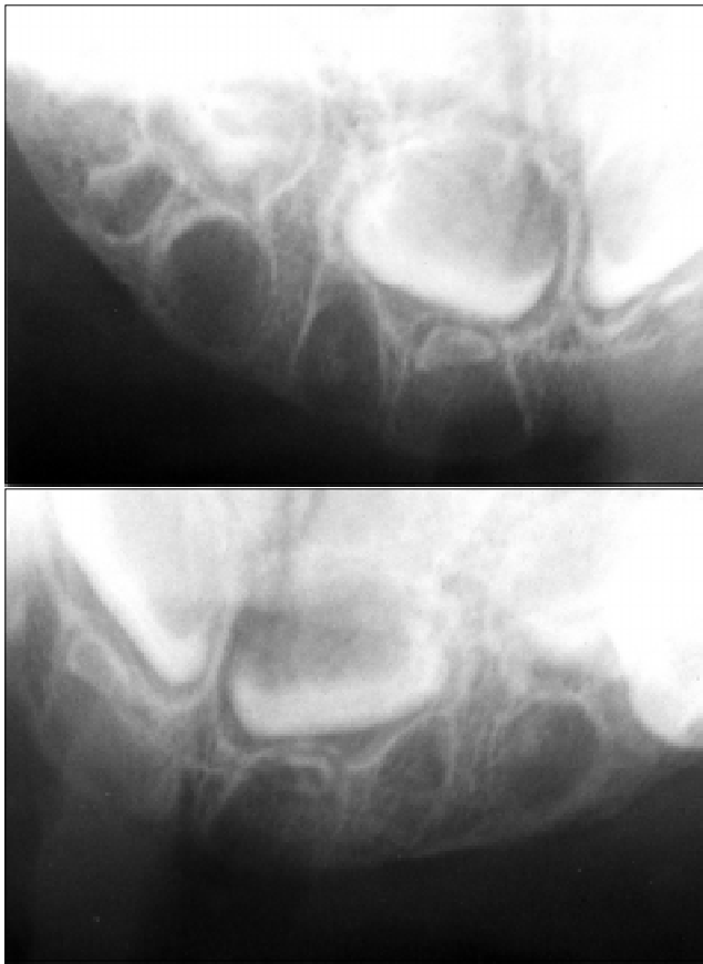
Fig 1. Right (above) and left (below) occlusal radiographs demonstrating empty avulsion sockets of all incisors, canines and right first primary molar. Note residual root apex of right central incisor. Also, it appears that both permanent lateral incisor tooth follicles are missing. Radiographs were exposed adjacent to the traumatic incident.

when a primary tooth is injured. The effect may be either direct or indirect: Directly, for example, at the time of avulsion the apex of the primary tooth may damage the tooth follicle of the developing permanent tooth. Indirectly, for example, when a primary tooth becomes non-vital, periapical infection may damage the immature labial enamel of the underlying permanent tooth. 4