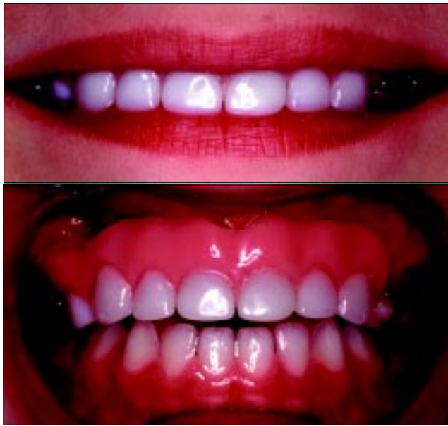
Fig 7. Anterior extraoral (above) and intraoral (below) views of the appliance in situ

appliance's retention consisted of a labial flange extending into the labial vestibulum and orthodontic clasps held into place with the composite buttons on the molars. The child adapted well to the appliance and was placed on six-month recalls.