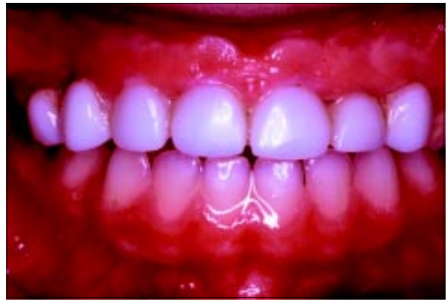
Fig 4. Intraoral view demonstrating the appliance after two years of use

Two weeks later, the child returned for appliance cementation. The appliance was similar to a Nance holding arch, but had plastic teeth processed onto the wire instead of a palatal acrylic button in the rugae area (Fig 3). The round wire was thick and rigid (0.040 inch in diameter) and was attached to the first and second primary molars with prefabricated stainless steel bands. Each individual tooth was welded and soldered onto the archwire. Although the arch wire had a relatively long span, it was particularly stable due to its unique fabrication and rigid attachment to the bands. The palatal acrylic button of the traditionally designed modified Nance holding arch was