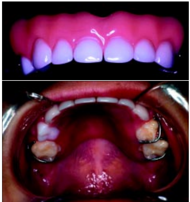
Fig 6. At age four-and-a-half, it was determined that the child was mature enough to adapt and care for a removable appliance. Anterior (above) and intraoral occlusal (below) views of the removable appliance.

Six months later the patient returned with red hypertrophic gingival inflammation. The appliance was removed and strict oral hygiene instructions were given. Five days later, the gingiva had improved and the appliance was recemented. The patient continued to return for recall examinations at 4- to 6-month intervals (Figures 4, 5). At age four-and-a-half it was determined that the child was mature enough to adapt and care for a removable appliance and a decision was made to replace the fixed appliance with a removable one (Figures 6, 7). Composite build-ups were placed on the buccal aspects of the molar abutment teeth to aid in retention of the appliance. The