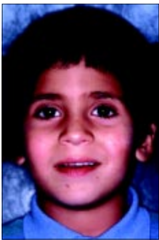
Fig 5. Facial view of the appliance demonstrating the positive adaptation of the child to the appliance

orthodontic needs. The prognosis of the residual root and its probable resorption or exfoliation was also explained. One week later, all soft tissues were healing without any complication and the patient was placed on a six-month recall.