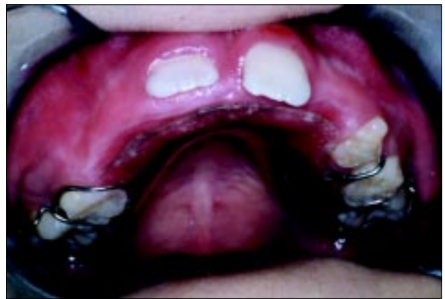
Fig 9. Anterior/occlusal view of the patient at six-year follow-up. An acrylic removable appliance is functioning as an interim space maintainer.

had worn dentures from early childhood exhibited no articulation errors, while those who did not exhibited articulation errors directly related to dentition. This study concluded that patients who receive prosthetic dental appliances (two years is optimal as related to speech) develop better articulation skills. 8 Another study 9 found that loss of all maxillary primary incisors before age 3 years resulted in some speech problems in some children. While the data is incomplete, appliances for children under 3 years of age that have not yet developed their speech skills (children over 4 years will usually compensate for the tooth loss and not exhibit any long-term speech disorders) should be highly considered.