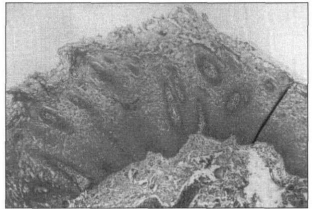
Fig 2. Mucosal fragments that display prominent epithelial thickening with acanthosis and hyperparakeratosis.