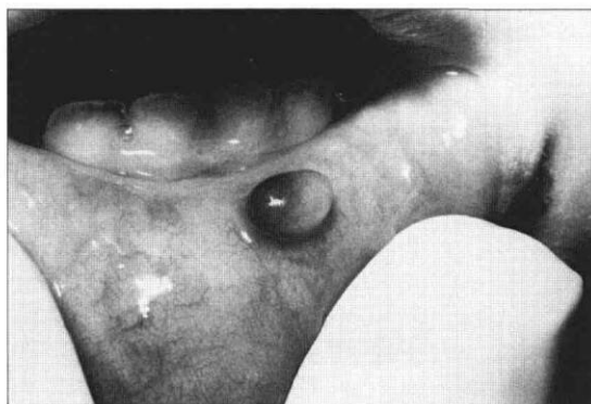
Fig 1. 2-year-old patient with a mucocele in the lower lip.

Treatment consisted of direct application of liquid nitrogen with a cotton swab without local anesthesia or any sedative agent. Each lesion was exposed directly to eight to 10 consecutive freeze-thaw cycles, each cycle of 5 to 10 sec, beginning at the center of the lesion, then all the borders until the lesion appeared white and frozen (Fig 2). All patients were scheduled for a 1-week, 2-week and 6-month postoperative evaluation.