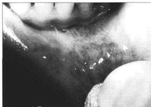
Fig 4. Six months postoperative evaluation.

When a long cycle of 7 to 10 sec was used, some patients reported a slight to moderate burning sensation, but when a 5-sec cycle was used, no pain was reported by any child. During the first 10 min after freezing, mild erythema and swelling was noted. After 1 week all the patients returned to our clinic for evaluation, and in all six cases the mucocele had reduced in size (Fig 3). A secondary application was performed, using the same technique, and the patients returned to the clinic 1 week after for a postoperative evaluation. All the lesions disappeared completely with no evidence of scarring, bleeding, or infection. At the 6-month follow-up visit, no recurrence was noted in any patient (Fig 4).