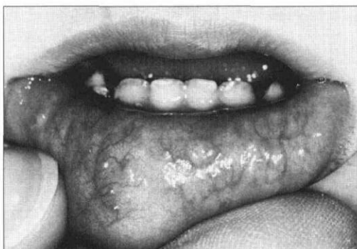
Fig 3. Lesion reduction after 1 week of treatment.