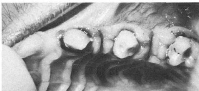
FIGURE 3. Clinical picture following appliance removal.

determined 4-, 6-, 8-, and 10-week intervals, appliances were removed and soft tissue samples from the bony base were obtained. No animals were sacrificed during the study.