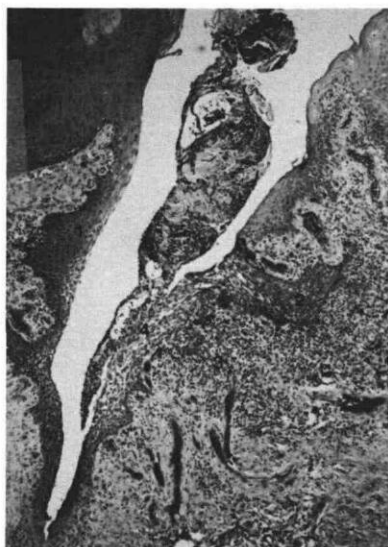
FIGURE 4. Representative photomicrograph of tissue sulcus at six weeks. Epithelium (1) lines the sulcus with some increase in rete peg proliferation (2). Concentrated areas of inflammatory infiltrate exist (3). Widened intercellular spacing (4) is present representing epithelial breakdown. Hematoxylin and eosin 40 \times .

and Zander, 6 and Schroeder and Münzel-Pedrazzoli. 7 A single column of the grid 10.0 \mu wide was used to count epithelial cell thickness from the epithelial surface of the basal cell layer.