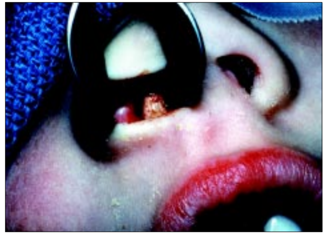
Fig 4. Surgical photograph showing speculum expansion of the right naris prior to forceps delivery of the intruded maxillary right primary central incisor.

Due to the pliable bone that surrounds them, primary maxillary incisors are easily luxated and intruded. These short rooted teeth can be intruded to the point where they appear