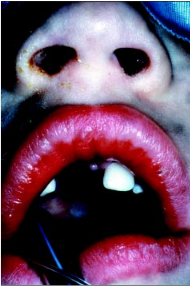
Fig 3. Presurgical photograph following intubation.

Due to potential behavior management problems and the complicated access to the intruded tooth, the patient was referred to an oral surgeon for extraction of the central incisor. The maxillary right primary central incisor was extracted utilizing a nasal approach (Figures 3 and 4). The impacted tooth was delivered via forceps through the right naris. The patient had a normal post-operative recovery. Nine months following the initial examination, the patient appeared to have uncomplicated healing. An occlusal film taken at that recall appointment revealed normally developing maxillary permanent central incisors. Unfortunately, the patient was lost to follow-up prior to the emergence of the maxillary incisors.