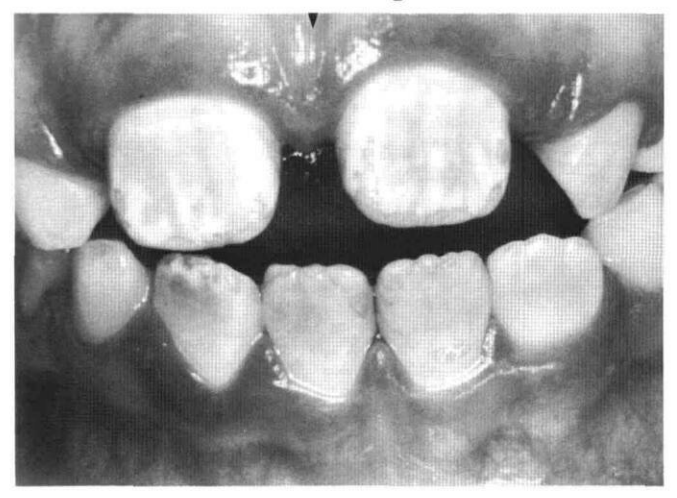
Fig 1. Intraoral photograph of case 1 showing almost normal appearance of the primary dentition and fluorosis of the permanent dentition. Note the irregular white flecks and corrosion-like lesions at the incisal edges and interproximal areas.

The patient was in the mixed dentition stage. The primary dentition was morphologically normal. The main clinical defect was the chalky discoloration of all the permanent incisors and the first permanent molars, indicative of dental fluorosis (Fig 1). The anterior teeth