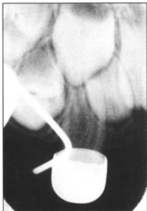
Fig 2a. Case 2: Maxillary right primary canine.

nines in both arches and normally positioned permanent canines and maxillary lateral incisors. The primary canine crowns were normal in color, shape, and size. The maxillary right and left primary canines measured 7.5 mm and 7.3 mm respectively, and the mandibular right and left primary canines each measured 6.5 mm mesiodistally. The child has no siblings, and the parents reported no knowledge of birooted canines in other family members.