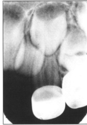
Fig 2b. Case 2: Maxillary left primary canine.

shape, or size of their clinical crowns. The remaining dentition was normal. This child's one sibling, an older sister, had a single panoramic radiograph demonstrating normal primary canines.