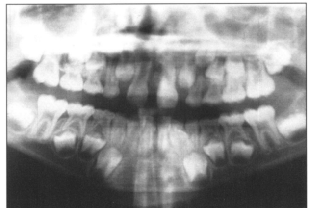
Fig 3. Case 3: Maxillary and mandibular primary canines.

The influence of the additional root upon crown morphology was assessed by measuring the mesiodistal dimensions of the affected teeth. There was no elon-