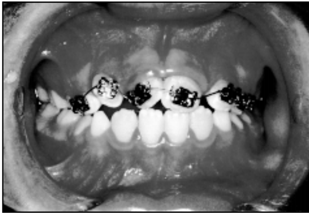
Fig 4. A .014 Ni Ti 00 nickel-titanium arch wire (Sybron Dental Specialties Inc., Orange, CA, USA) was placed and ligature ties were secured around all brackets. Frontal view.