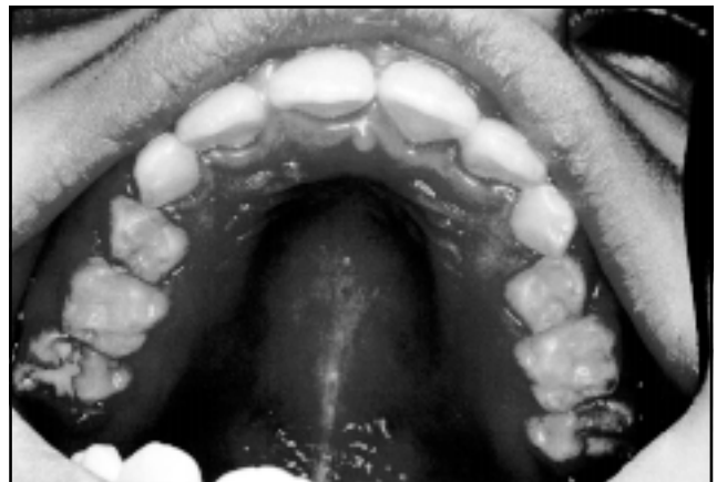
Fig 7. Occlusal view.