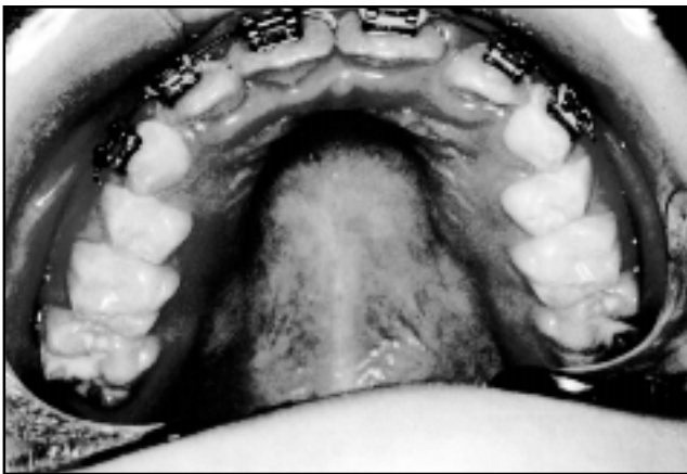
Fig 5. When the archwire was passive in all bracket slots, ligature ties were replaced with elastomers.