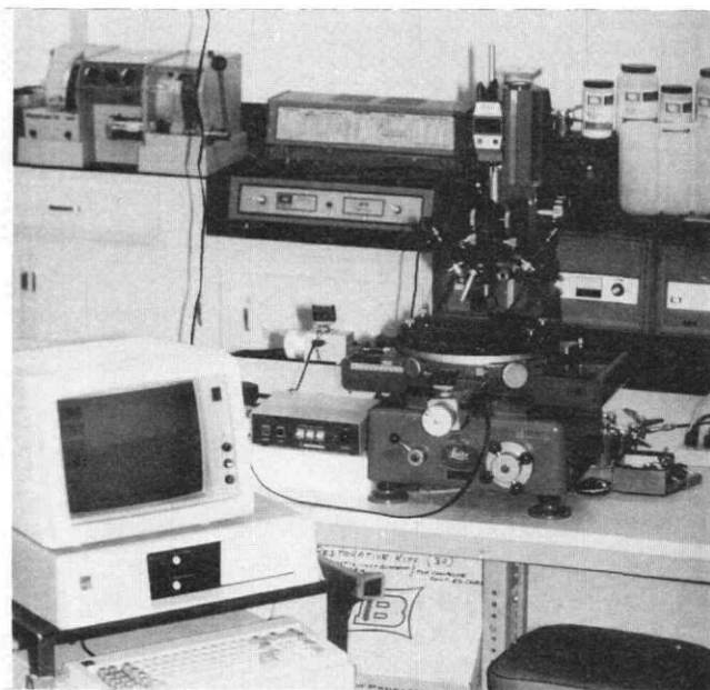
Fig 1. The measuring microscope with digimatic stage positioning and microcomputer interface.

Three extracted permanent molars which had been stored in distilled water and thymol were used to establish the precision of repeatedly recording the location of an enamel surface. None of these teeth showed visible signs of fluorosis or any other noticeable defect or decalcification. Each tooth was mounted horizontally in a small block of improved die stone with the buccal surface exposed. Each tooth then was mounted on a measuring microscope (Leitz Optical Measuring Microscope, E. Leitz Inc., Rochleigh, NJ) for recording the location of the enamel surface (Fig 1).