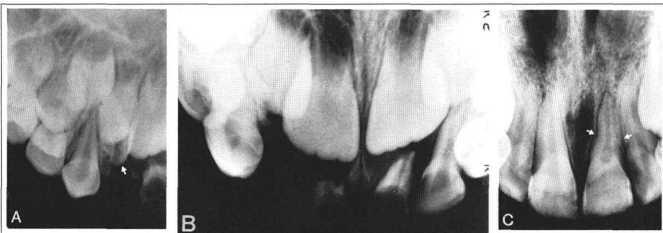
FIG 3. Patient 39. A & B. Periapical radiographs taken 2 days after the trauma. Note the intruded B| and the pathologic root resorption of A|A accompanied by periapical bone destruction. C. Periapical radiograph taken at age 10 years. Note the dilaceration at the middle one-third of the root of 1| and an obliteration of its pulp chamber.

apical third of its root. At this stage, A|B were extracted and the severely malformed left permanent lateral incisor was removed surgically. At a further follow-up examination, delayed eruption of 1| was observed.